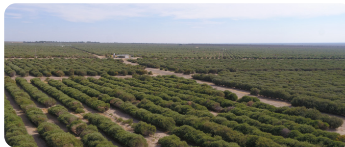
Vantage farm in Argentina

Our Argentina operations serve as a flagship for operational excellence and resource efficiency. Since the site’s acquisition in 2015, the implementation of precision drip irrigation has allowed us to reduce water consumption by almost 40%. We have also recently integrated solar energy into our infrastructure, installing on-site panels to supplement electricity consumption with renewable power. Furthermore, we leverage partnerships with local universities and researchers to pioneer new applications for our production by-products.