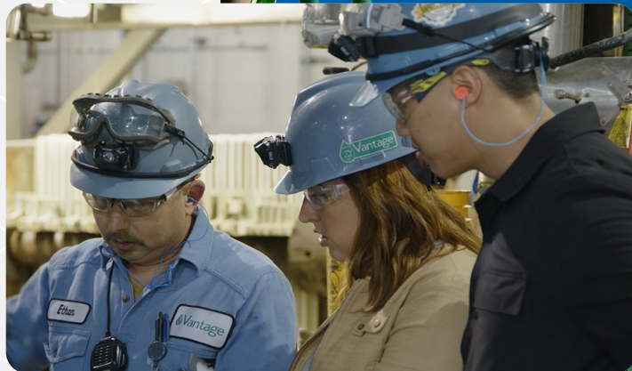
Vantage Employees at our Gurnee Plant